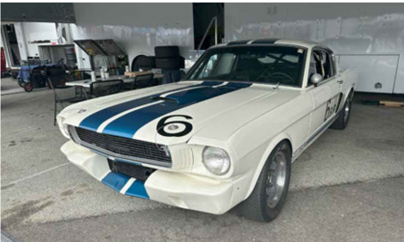
There were many 60's muscle cars but this is one of the most famous Shelby Mustang GT350Rs.