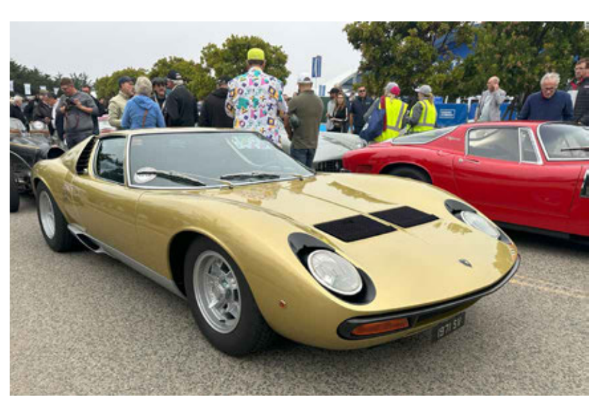
Gorgeous Lamborghini Miura lined up to drive Pebble Rally. The red car is an Iso Grifo.

start with, I make a decision to attend early and book a hotel early. This will save you hundreds of dollars. I usually stay in Monterey or Seaside (just next door) and since we are going to be busy all day, the hotel is just a bed and a shower. We aim for cheap with a "Motel 6" style. However, if you leave it too late, even these low-end hotels, if they still have availability, can cost over $500.00 per night! Next, do your research, there are so many free events that are wonderful and I love! For example, this year's itinerary: We started on Wednesday, August 14th by attending "the Smallest Car show" on the streets of Pacific Grove – limited to all cars under 1.600cc's. The show is free to viewers and this is an excellent start to the main events. The