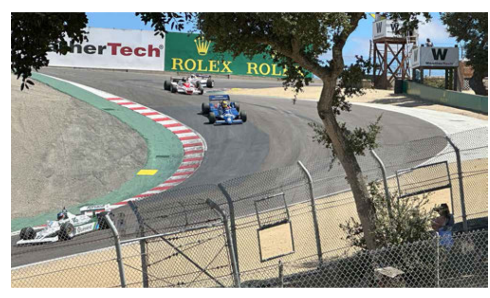
The view of the famous Corkscrew – F1 cars on full song!