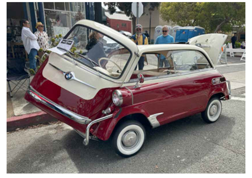
A four-place BMW Isetta, one of the quirky cars at the Smallest Car Show.

watch historic race cars in many staged races over two weekends of racing, but you can walk the pits, meet the drivers and mechanics, and get up close at the cars.