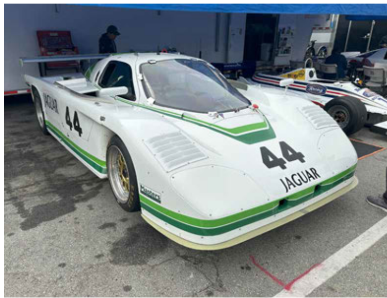
Famous race cars in the pits included this IMSA Group 44 Jag XJR-5 from the mid-1980s.

So, how to have fun and do it on a budget? This was my ninth year attending car week and I have enjoyed it every time. This year was no exception and perhaps one of the very best! To